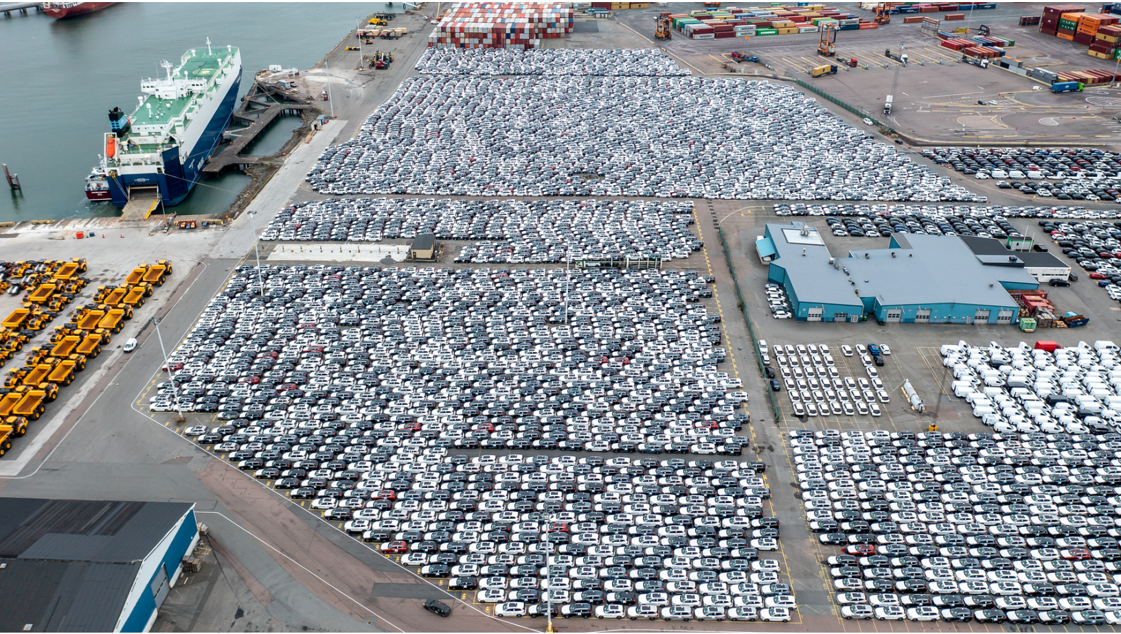
The car terminal at the Port of Gothenburg.